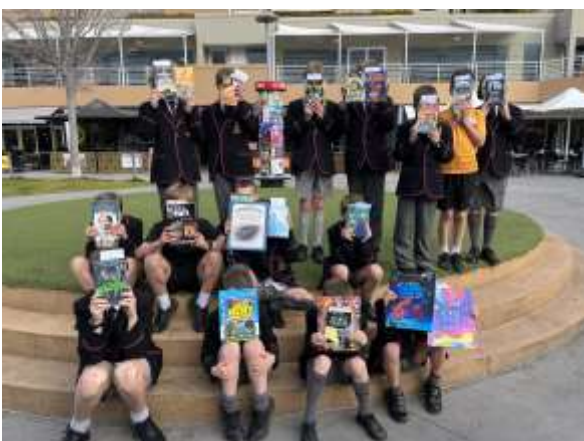
Book Buying Excursion where a group of students select titles of choice. Also a spinoff from our Australia Reads event.