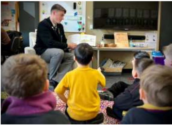
Pop Up Readers initiated by 25 guest readers (staff and senior students) visiting younger classes.