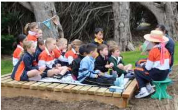
Story Walks with Fahan students in outdoor settings for shared story sessions.