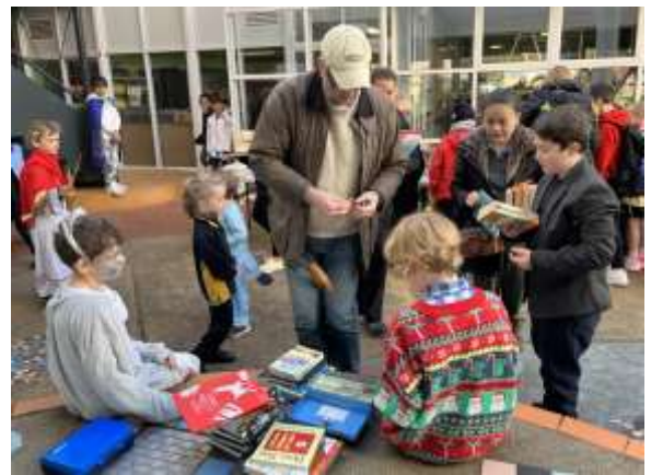
The Great Book Swap to support the Indigenous Literacy Foundation.